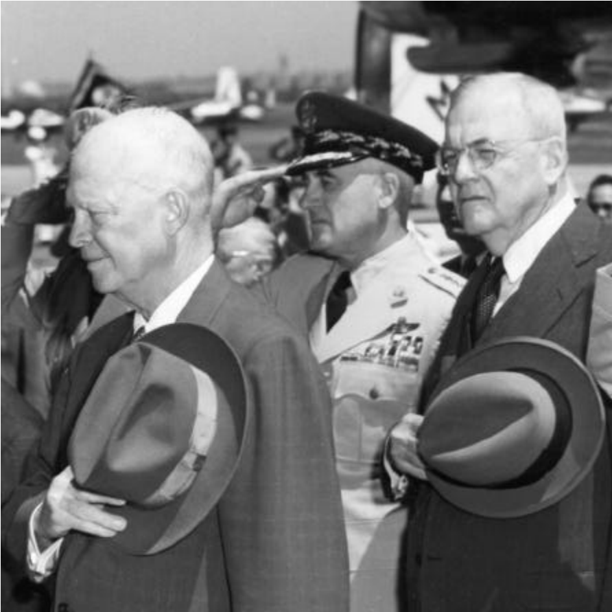
President Dwight D. Eisenhower, Gen Nathan F. Twining, and Secretary of State John Foster Dulles

establishment of its Special Commission for Interplanetary Communications, making reference to a globe circling satellite program. 28 In 1955 the US was completing the formulation of its first space policy, but it did so in a somewhat ambivalent manner. The United States assumed that its space program was technologically superior to the USSR's space program. Indeed, the US was far ahead of the Soviets in miniaturizing its warhead devices (which fact was highly classified at that time); however, as discussed later, this US advantage was to become a double-edged sword.