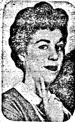
CAROL BURNETT She Made an Impression