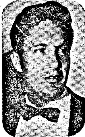
ROBERT STACK Solves Too Much

(And if the lady will send her present address, we will return her treasured evidence forthwith.)