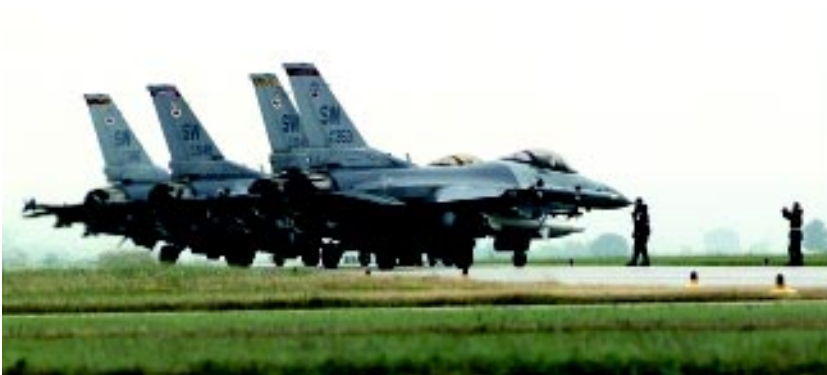
Four U.S. Air Force F-16 Fighting Falcons line up at the end of the runway at Aviano Air Base, Italy, for final checks before taking off on NATO Operation Allied Force missions in May 1999.

■ To ensure transatlantic security in the future, the United States and its Allies must improve defense capabilities in the fields most relevant to modern warfare. Operation Allied Force reinforced the fact that we need more deployable, sustainable, interoperable and flexible forces to engage effectively in a wide variety of situations. The United States is already moving to address these requirements, and we look to the rest of NATO to do its share. This effort will not be cost-free. All Allies have the responsibility to match their rhetoric with real resources. In many cases this will require increased defense budgets as well as smarter spending and pooling of resources.