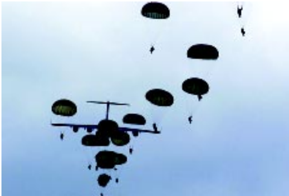
Paratroopers from the U.S. Army's 82nd Airborne and the Ukraine's 80th Air Mobile parachute from a C-17 Globemaster III.

improved training for border security and customs personnel and assistance to redirect the expertise of Ukrainian weapon scientists to work on peaceful scientific and engineering projects, such as improved safety and security for civilian nuclear installations and managing the environmental and health consequences of the Chernobyl disaster.