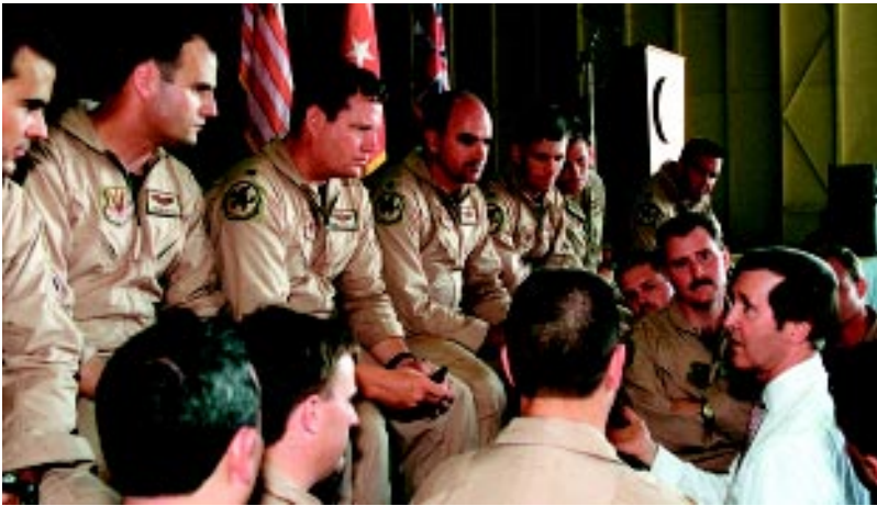
Secretary Cohen talks with U.S. Air Force F-16 Fighting Falcon pilots of the 120th Fighter Squadron.

We are therefore working with Allies and Partners to institutionalize democratic reforms in Central and Eastern Europe, and to integrate the states of that region into Euro-Atlantic structures. Such reforms can help avert or resolve problems that, if left unchecked, may lead to ethnic conflict and regional violence,