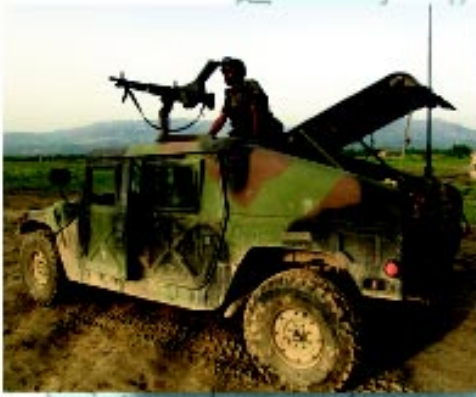
An Air Force security specialist watches the perimeter at Rinas Airport in Tirane, Albania during NATO Operation Allied Force. Air Force personnel provided airfield security for incoming aircraft and personnel deployed to the airport in support of Task Force Hawk and Joint Task Force Shining Hope.