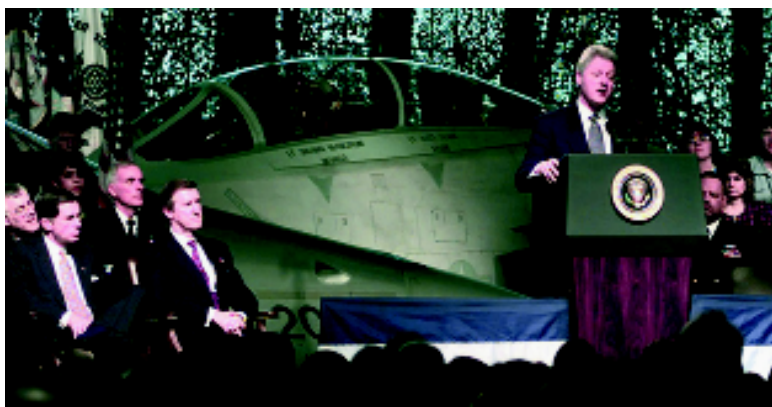
President Clinton thanks personnel deployed overseas in support of U.S. and NATO operations.

In the Euro-Atlantic region, we pursue our shape, respond, and prepare strategy through three mutually reinforcing layers of engagement centered on NATO, multilateral engagement with countries participating in NATO's Partnership for Peace (PfP) and members of the EU, and bilateral engagement with individual Allies and Partners. Within each layer of engagement, U.S. military forces stationed in Europe play a key role in advancing our security objectives.