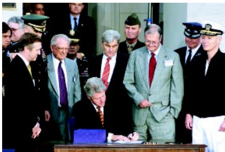
Defense officials and members of Congress surround President Clinton as he signs the National Defense Authorization Act FY 2000.

A second explanation is less self-evident: in far too many instances, the substance of our transatlantic cooperation is overshadowed or even impeded by differences in tone . Americans, for example, frequently refer to their “leadership” of the Alliance. For many Americans, this concept is essentially an accurate reflection of objective facts—in particular, the real disparities in military capabilities between the United States and