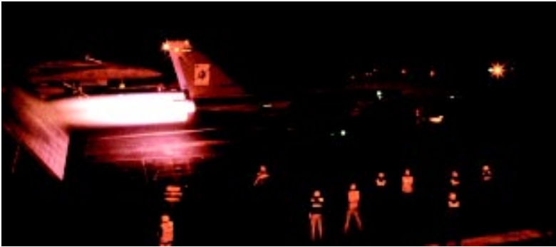
A U.S. Navy F-14 Tomcat goes to full afterburner as it prepares to launch.

facilitate efforts by potential adversaries—both hostile states and increasingly sophisticated terrorists—to develop or acquire nuclear, biological, and chemical (NBC) weapons and the means to deliver them. Humanitarian disasters beyond Europe can have an important impact on transatlantic interest and require joint U.S.–European responses.