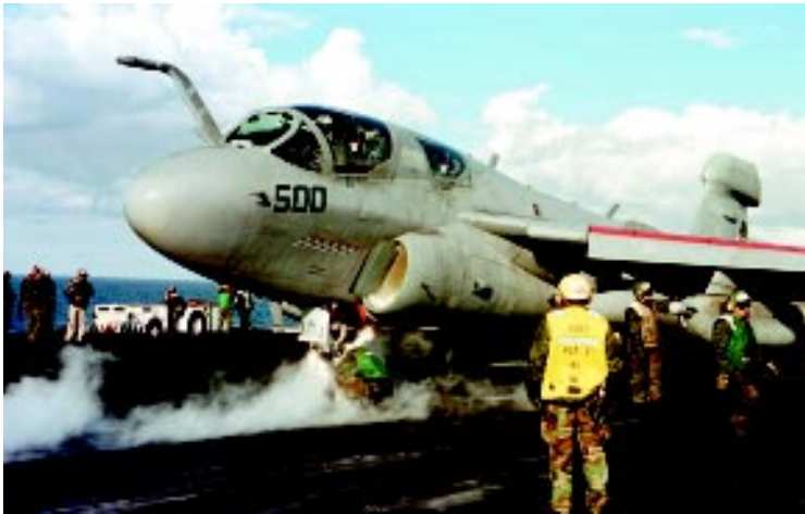
An EA-6B Prowler is prepared for launch off the USS Enterprise in the Adriatic Sea.

and an Alliance-wide consensus for action simply does not exist. We will do what we must to defend these interests, including, when necessary, using our military might unilaterally. In practice, however, this has occurred very rarely. We see a broad and growing spectrum of issues that are important to our security and where close cooperation with our Allies and Partners is a requirement—not an option. While some foreign policy commentators on both sides of the Atlantic seem quick to level charges of American “unilateralist” or “isolationist” tendencies, the facts almost never support such claims—and we should not be reluctant to point this out.