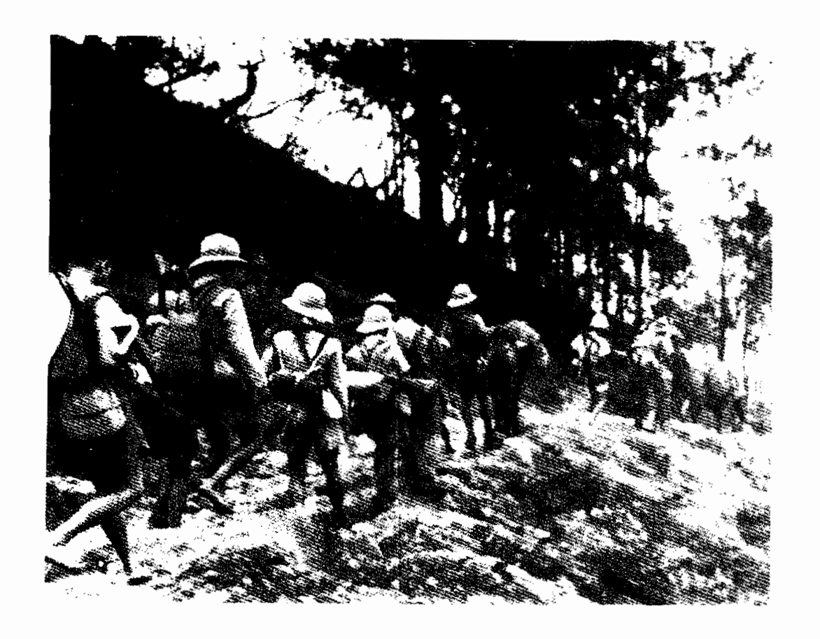
(U) French colonial troops retreating into southern China, March 1945