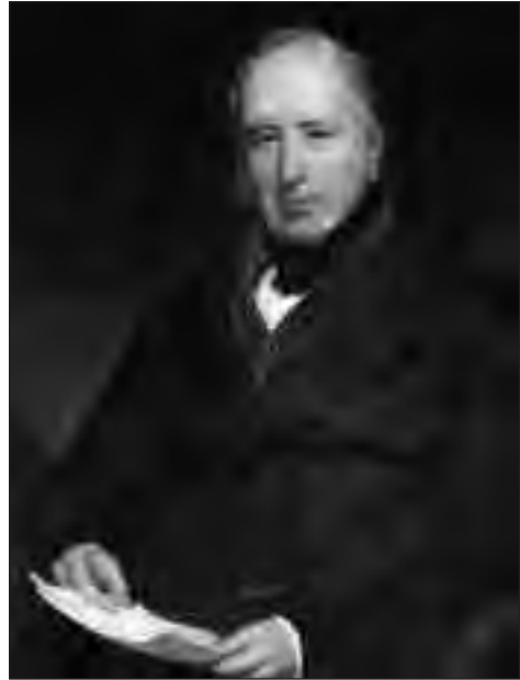
If anyone can be known as the "father of modern aeronautics," it is Sir George Cayley (1773–1857). Not only did he set down the fundamental concepts that defined the airplane in its present-day form, but he was also the first to link a scientific study of aerodynamic principles with the actual design and operation of flying machines. SI Negative No. 75-16335

What brought experimenters, finally in the late nineteenth century, to the birth of a formal study of "aerodynamics" was the matter of lift—specifically the question, "Why do curved surfaces, in particular, perform so well in flight?" Cayley had shown that the curved shape of trout enjoyed low drag in water. This prompted applications of the shape to airplanes. In the 1880s and early 1890s, the great "Bird Man," German engineer Otto Lilienthal, built and flew a number