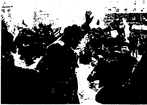
Figure E (Continued)