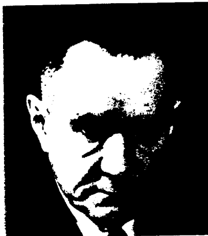
Kosygin: Minority Premier