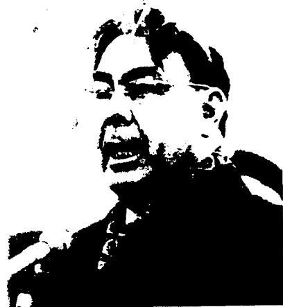
Brezhnev: Gathering Power