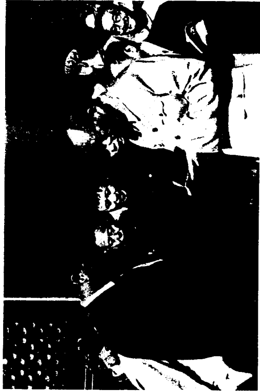
Mao Tse-tung autographs a copy of Quotations from Chairman Mao for Williams during Peking celebrations of National Day, 1 October 1966.

Chou En-lai congratulates Robert Williams at a rally in Peking on 8 August 1966 after a Williams speech hailing the "inspiration" to American Negroes of "our great leader and teacher, Chairman Mao Tse-tung." Williams vowed to "true revolutionaries throughout the world" that he would "set the last great stronghold of Yankee imperialism ablaze with our battle cry of Black Power."