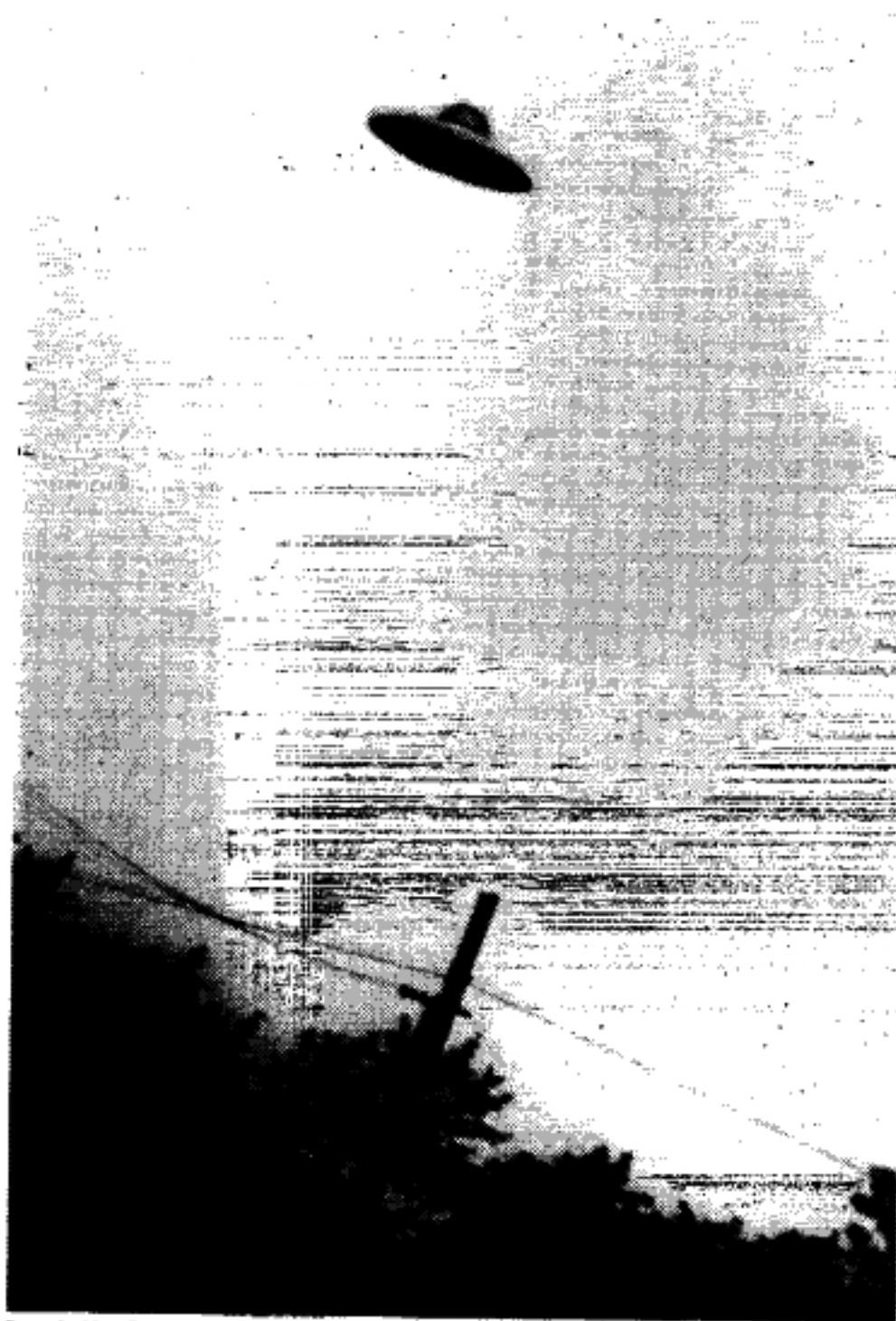
Passoria, New Jersey, 31 July 1952