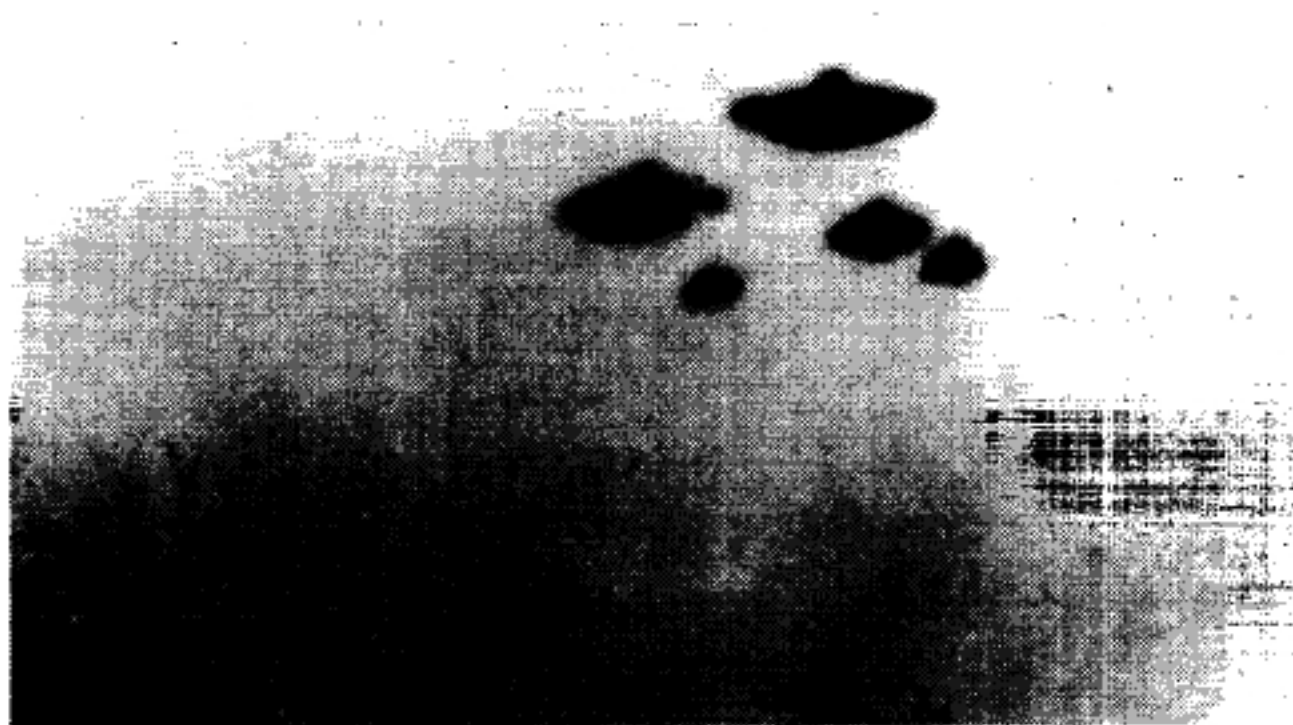
Sheffield, England, 4 March 1962